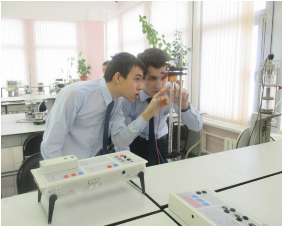
Fig. 2. In the IT Lab.

Many students at the Lyceum distinguish themselves by their achievements in creative technologies. Projects implemented by Lyceum students win prizes at all manner