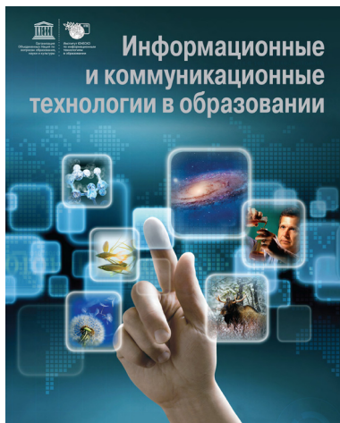
Fig. 1. The book “Information and Communication Technologies in Education”.